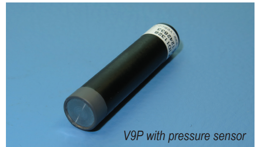
V9P with pressure sensor

For research requiring temperature and depth information, V9 tags can be equipped with temperature (V9T), depth (V9P) or both temperature and depth (V9TP). V9P pressure transmitters are available in the following full scale pressure options: 34, 68, 136 and 204 meters. V9T temperature transmitters are available in four temperature ranges: -5 to 35°C, -4 to 20°C, 0 to 40°C and 10 to 40°C. (See sensor tables on page 2 for accuracy and resolution details.)